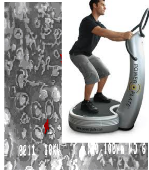
Laser treated at 6 minutes